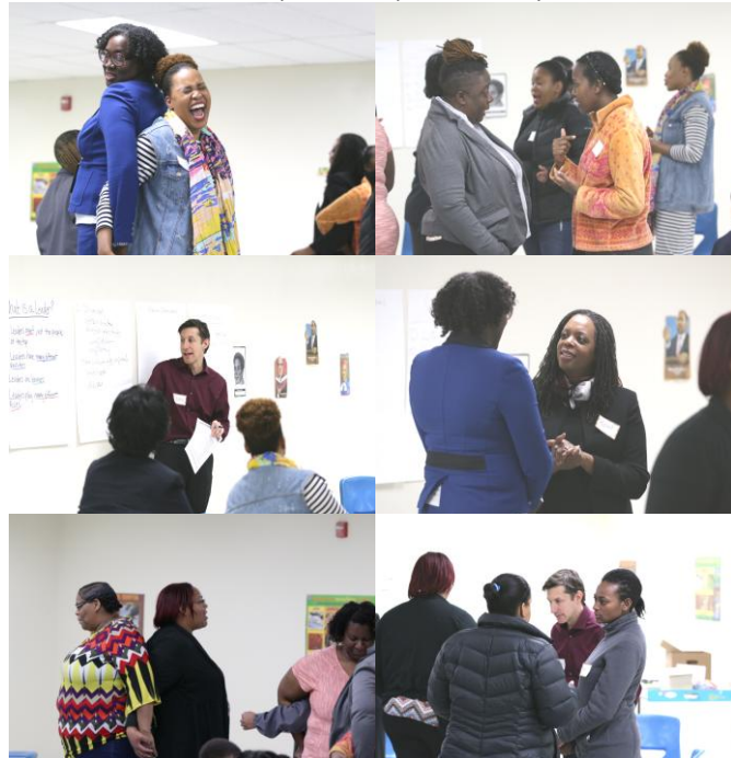
Parents are Our Partners!!!

Placing parents at the heart of the conversation as we promote Excellence at BJA is critical. Thank you to those parents who attended our first Parent Leadership Workshop last Tuesday.