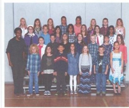
Design and class posing may vary by school. La pose de la clase y el diseño pueden variar según la escuela.